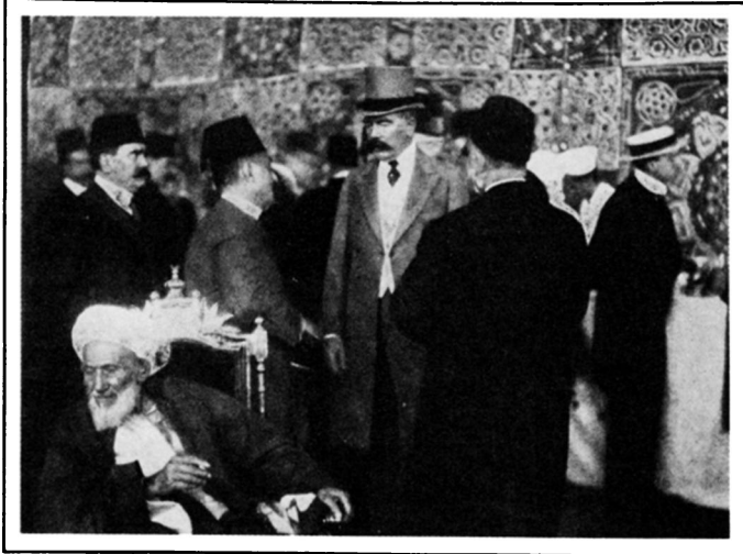
Lord Kitchener at the opening of a new quay in Cairo.

unions in addition to the Handicraft Workers' Union were formed. 13 Not all of these organizations engaged in strikes. But most were led by Egyptian nationalist intellectuals who saw the urban working class as an important mass base for political organizing. Egyptian workers relied heavily on these intellectuals for leadership, although in some trades the role of European workers was still important. Some of the associations formed during this period were organizations of legal clerks and office workers. The social position of these semi-professionals was hardly comparable to the railway or tram workers. The fact that they organized themselves into unions and participated in the struggles of this period is an indication that lines of class demarcation were not yet clearly drawn.